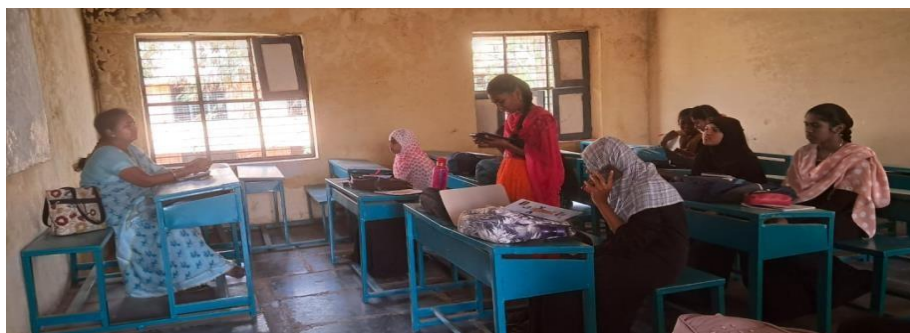
Oral Exam conducted to the participated student's of the certificate course